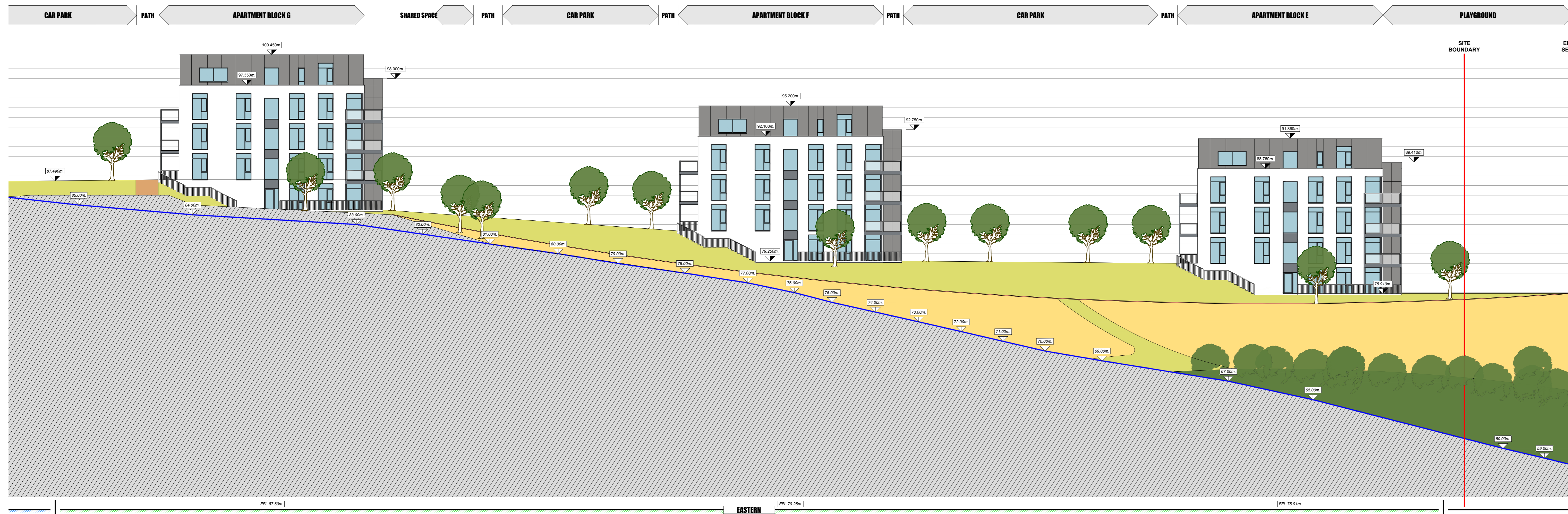
SITE SECTION K-K (2) SCALE 1:200