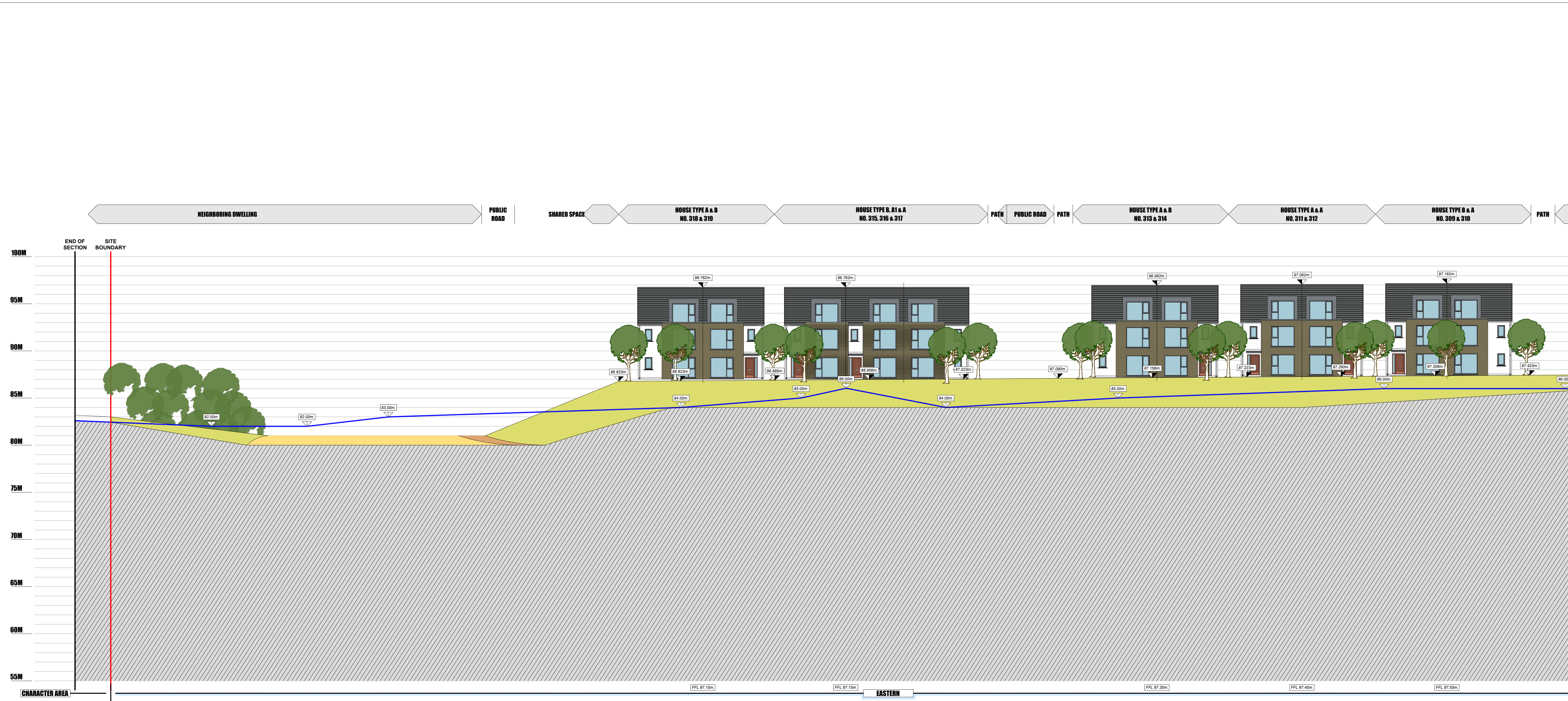
SITE SECTION K-K (1) SCALE 1:200